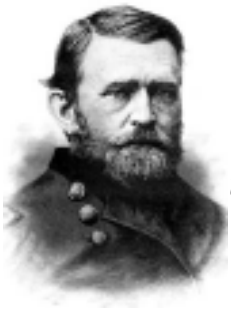
General Ulysses S. Grant